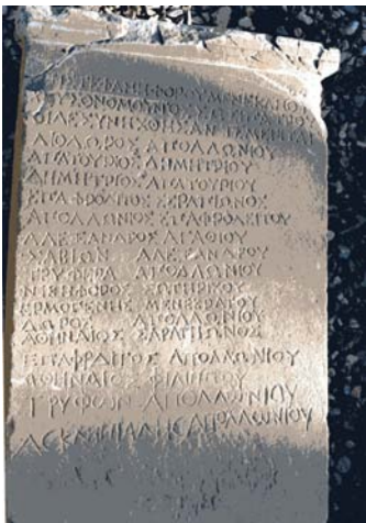
Inscription Milet VI 2,295

During the workshop questions related to the organization and realization of cultic rituals outside the cultic communities of poleis will be discussed on the basis of literary traditions and inscriptions. In this regard, the workshop will focus on the attraction and acceptance of religious activity outside traditional polis structures.