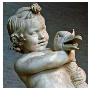
sog. Ganswürger Glyptothek München