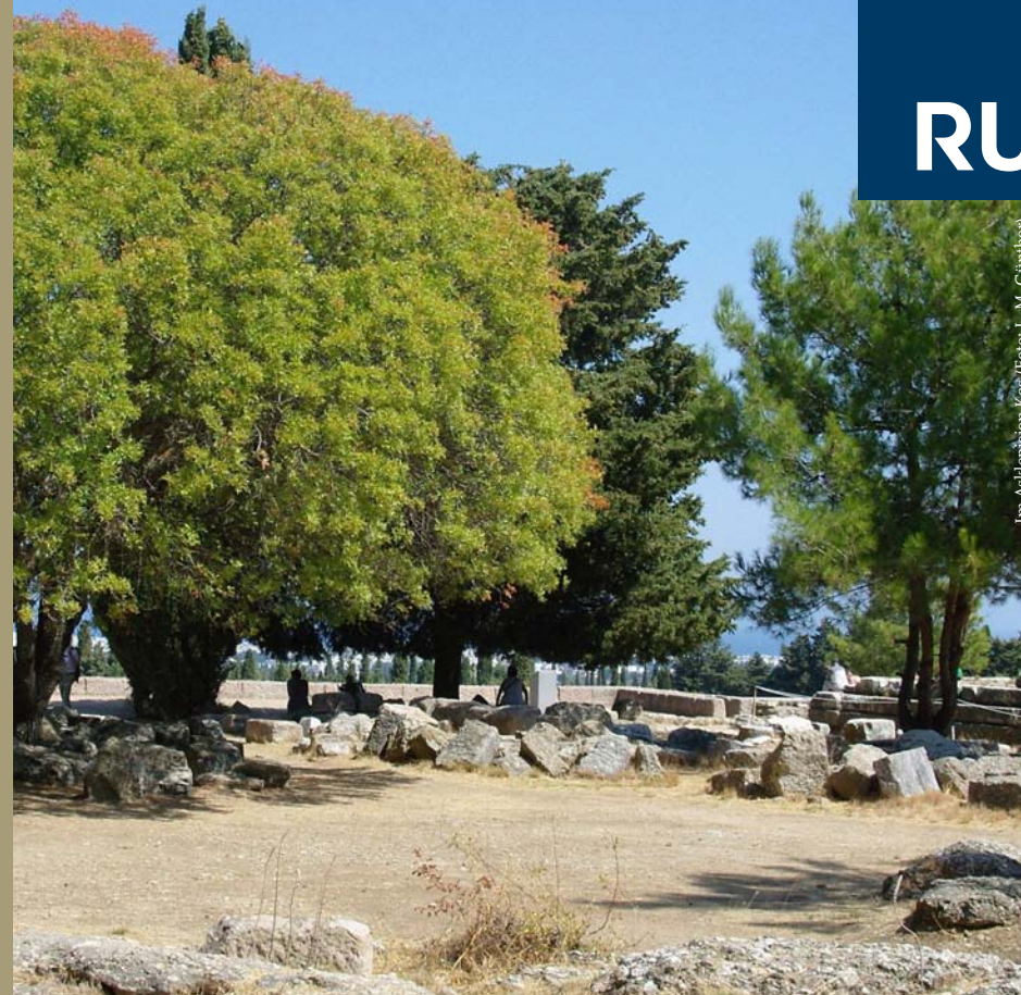
Im Asklepieion Kos