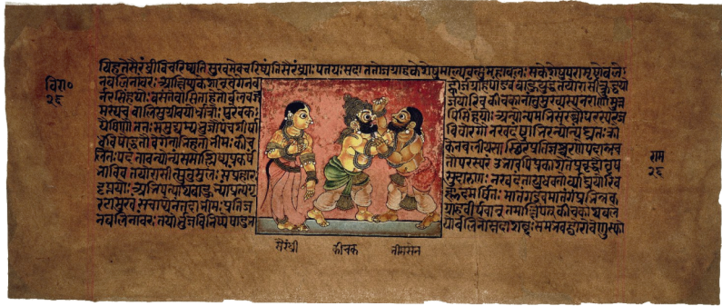
Kichaka and Bhimasena, Folio from a Dispersed