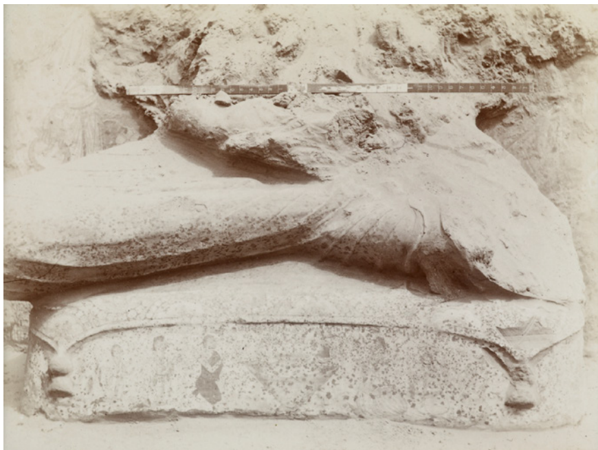
FIGURE 2.1 Remains of a Buddha sculpture with painted base with donors. In situ , from the temple Ta.i. in Tarishlak, Khotan, ca. 7th/8th c. (?).