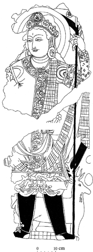
FIGURE 2.4 Line drawing of the painting found in Toplukdong Small Temple in Domoko, Khotan, 7th/9th c. (?). XINJIANG ARCHAEOLOGICAL TEAM, THE EXCAVATION ON THE BUDDHIST SITE OF DOMOKO , 300, FIG. 14

mahāsenāpati of the yakṣas ). Saṃjñāya told the king to build a vihāra in that spot, so that Buddhādūta and three other arhats would come there and expound the dharma to the king. This vihāra became known as Gomaṭī Monastery.