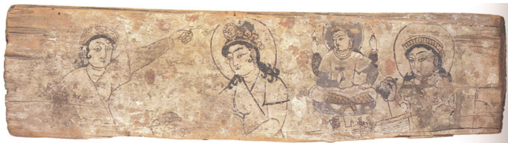
FIGURE 2.2 Painted wooden panel, 12 × 46 cm. Excavated at Dandān-öliq, Khotan, temple D.X, ca. 7th/8th century (?).