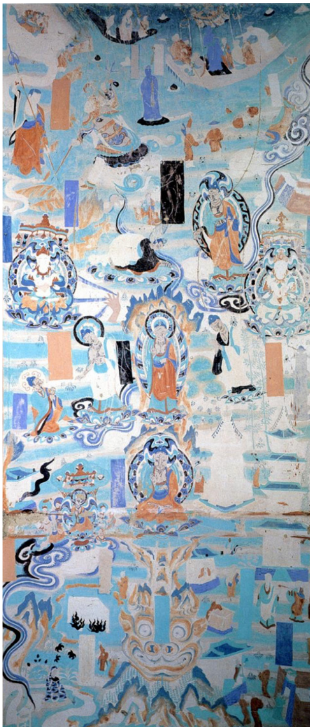
FIGURE 2.7 Depiction of Mt. Gośīrṣa/ Gośrṅga. Wall painting from the ceiling of the entrance corridor of Mogao Cave 9, 9th c. SUN XIUSHENG, ED., DUNHUANG SHIKU QUANJI 12: FOJIAO DONGCHUAN GUSHIHUA JUAN (2000), 90, FIG. 72