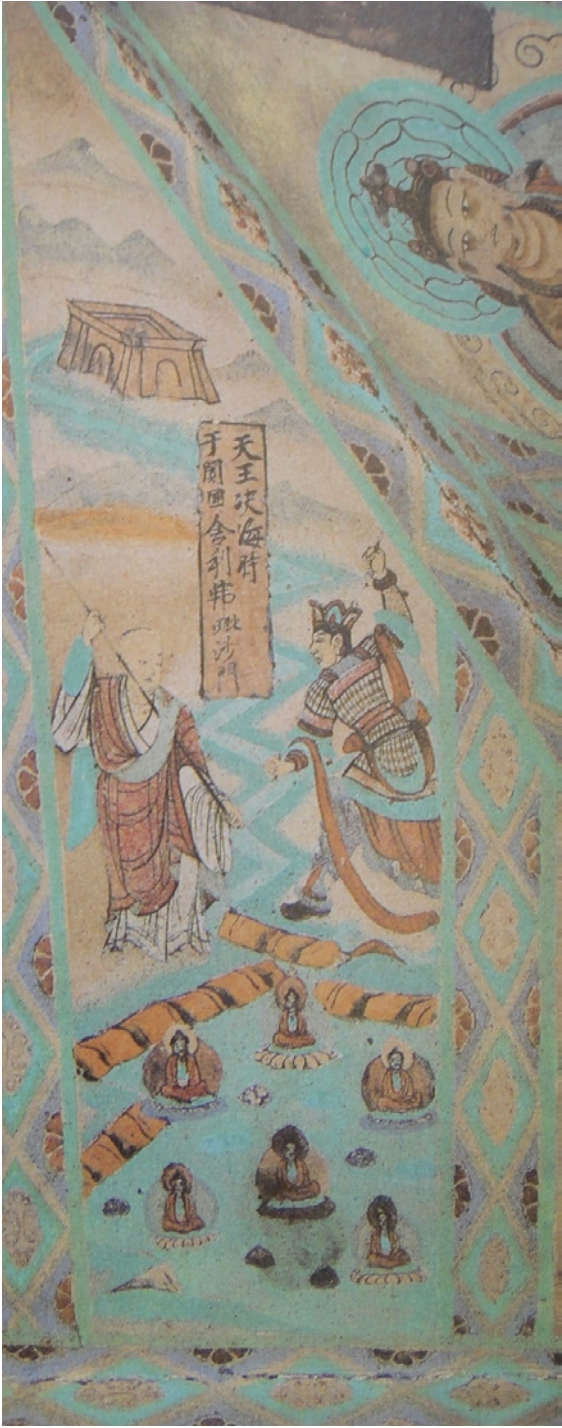
FIGURE 2.6 The founding legend of Khotan. Wall painting from the ceiling of the main chamber (western) niche of Mogao Cave 237, end of 8th–first half of the 9th c.