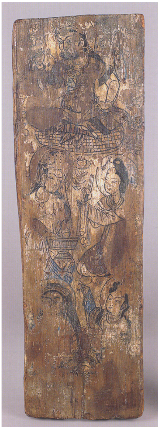
FIGURE 2.3 Painted wooden tablet, 49,5 × 13 cm. Found in Dandān-öliq, Khotan. IA-1125, STATE HERMITAGE MUSEUM