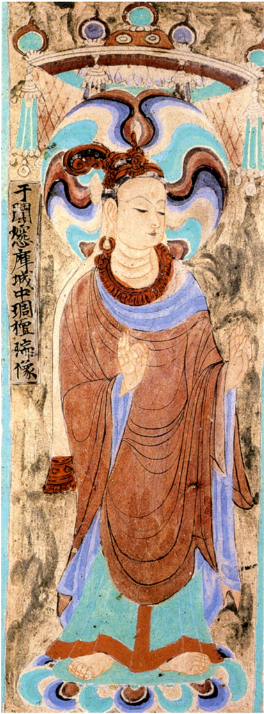
FIGURE 2.8 The auspicious image of Pimo. Wall painting from the main chamber western niche ceiling of Mogao Cave 231, 9th c. ZHANG XIAOGANG, DUNHUANG FOJIAO GANTONGHUA YANJIU (2015), 128, FIG. 2-1-3.