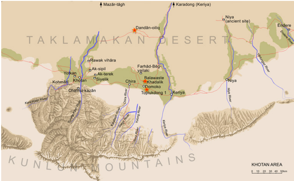
MAP 2.1 Main Buddhist sites of Khotan oasis, where depictions of legends have been found.

MODIFIED AFTER STEIN, ANCIENT KHOTAN , "MAP OF KHOTAN AREA," BY J. SCHÖRFLINGER